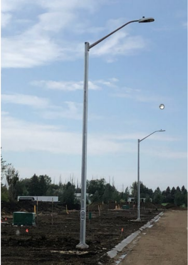
25' & 35' LED STRAIGHT SHAFT STANDARD, ONE ARM ON A CONCRETE FOUNDATION