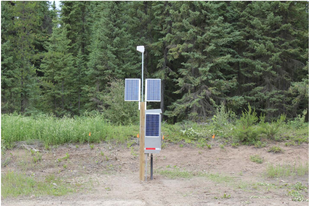
Figure 4-1 Traffic monitoring station

A commitment of the EIS was to conduct traffic monitoring in the vicinity of the Project to analyze the effect of construction activities on the existing road network, in particular PR 280 and PR 290. During the summer and fall of 2015, MI installed five in-pavement loop counters on PR 280 and PR 290. Figure 4-1 below shows a typical traffic monitoring station. Figure 4-2 shows the locations of the monitoring stations.