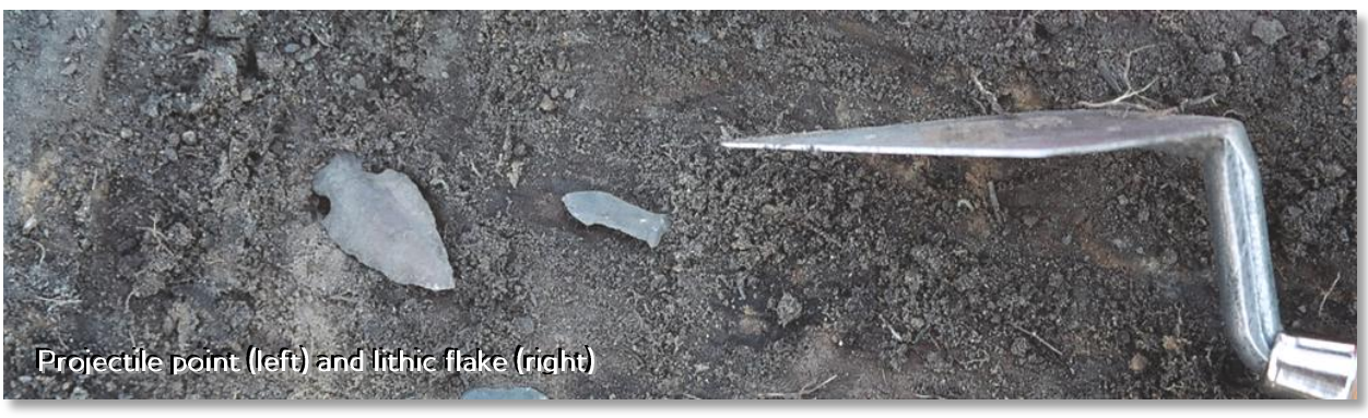
Standard cultural and heritage resources protection plan