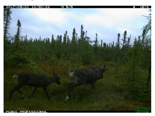
Photo 5: Collared caribou and calf in a peatland complex near the Project in 2017.

A detailed report on the findings of the caribou population and sensory disturbance survey can be found in the 2017 KHLP Keeyask Generation Project Terrestrial Effects Monitoring Report.