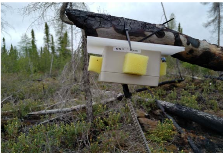
Photo 12: A passive audio recorder to monitor bird species of conservation concern.

and distance of each bird to the fixed location of the recorder will be estimated and the positions of the bird in its territory will be mapped. Audio recordings are being analyzed and results are pending. Survey support was provided by members of the Keeyask Cree Nations, including Tataskweyak, War Lake, York Factory and Fox Lake Cree Nations.