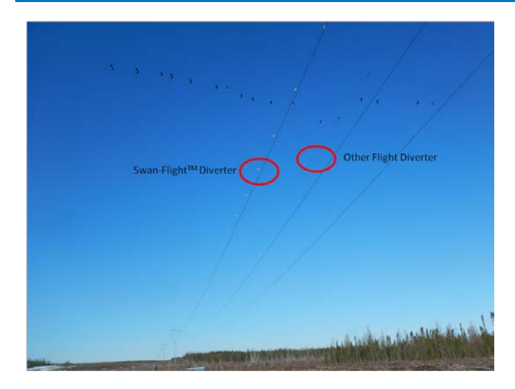
Photo 11: Canada geese flying over bird diverters installed on the generation outlet transmission line.