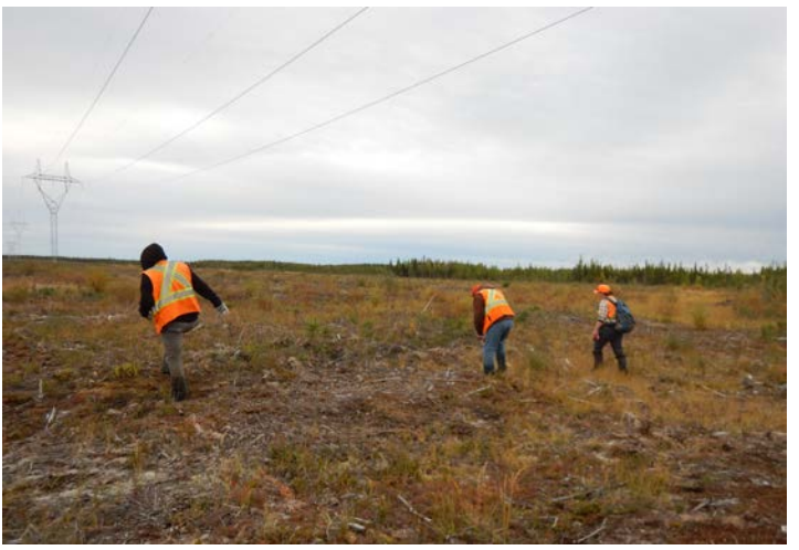
Photo 10: Survey personnel searching for bird-wire collisions at environmentally sensitive sites.

Survey information will contribute to evaluating longterm changes or trends in bird wire collision rates on this and other Manitoba Hydro transmission Projects.