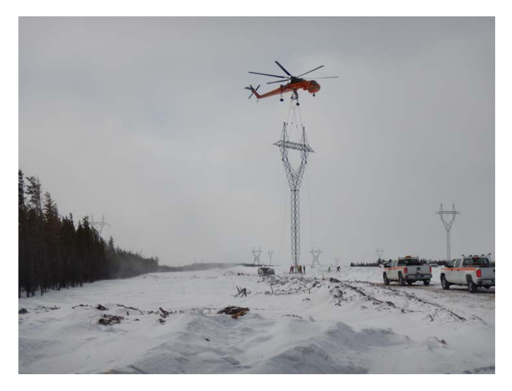
Photo 1: Keeyask Transmission Project is located south of Gillam, MB. Construction of GOT lines 2 and 3 is nearly complete.