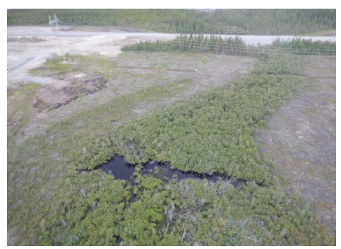
Photo 4: No evidence of vehicle track damage in 2017 with shrub re-growth present throughout this water course crossing.