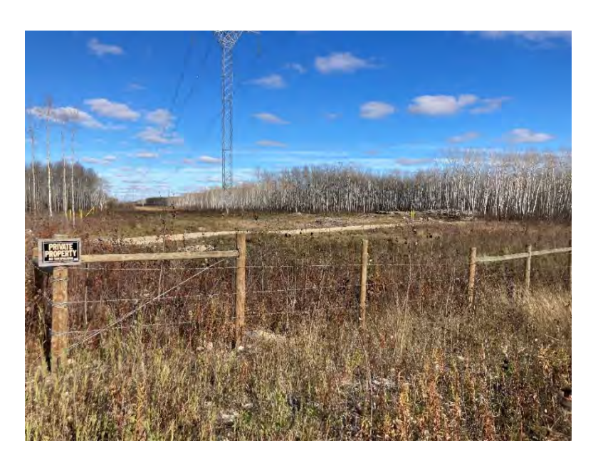
Access Management Point 306