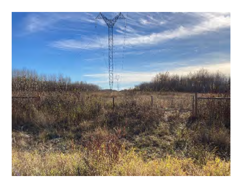
Access Management Point 360