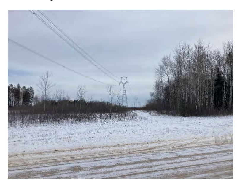
Access Management Point 421