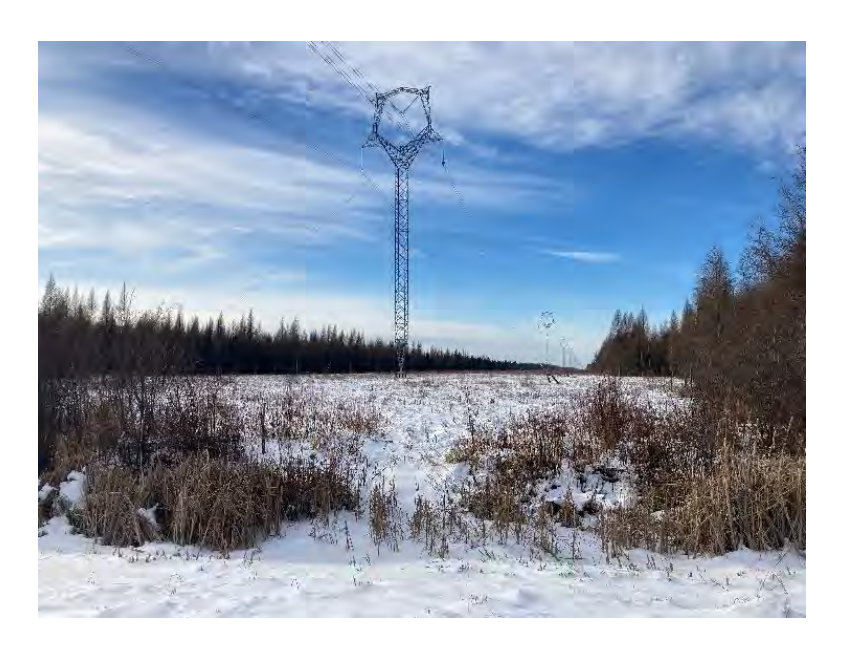
Access Management Point 473