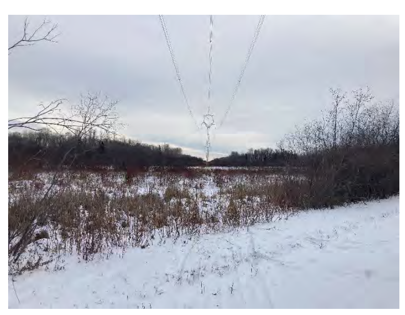
Access Management Point 402