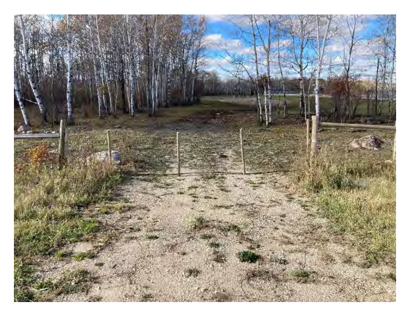
Access Management Point 294