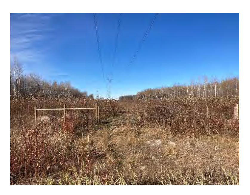
Access Management Point 359