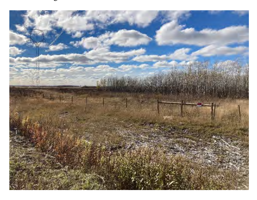
Access Management Point 305