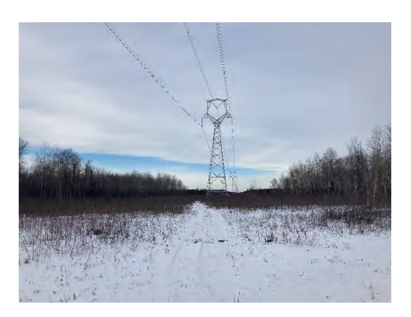
Access Management Point 420