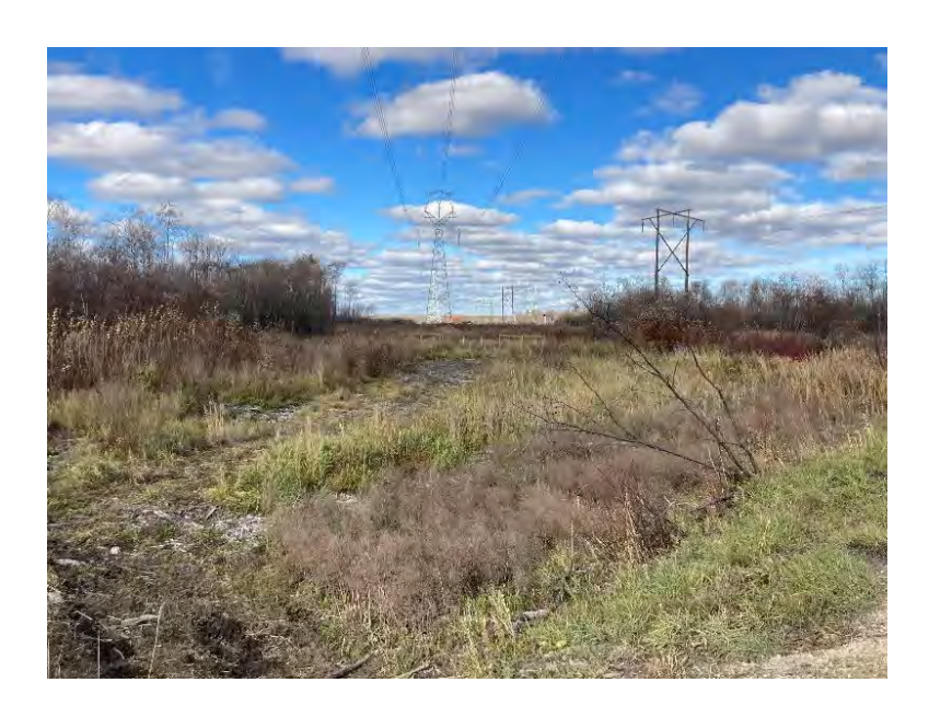
Access Management Point 282