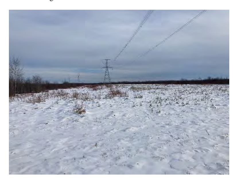
Access Management Point 474