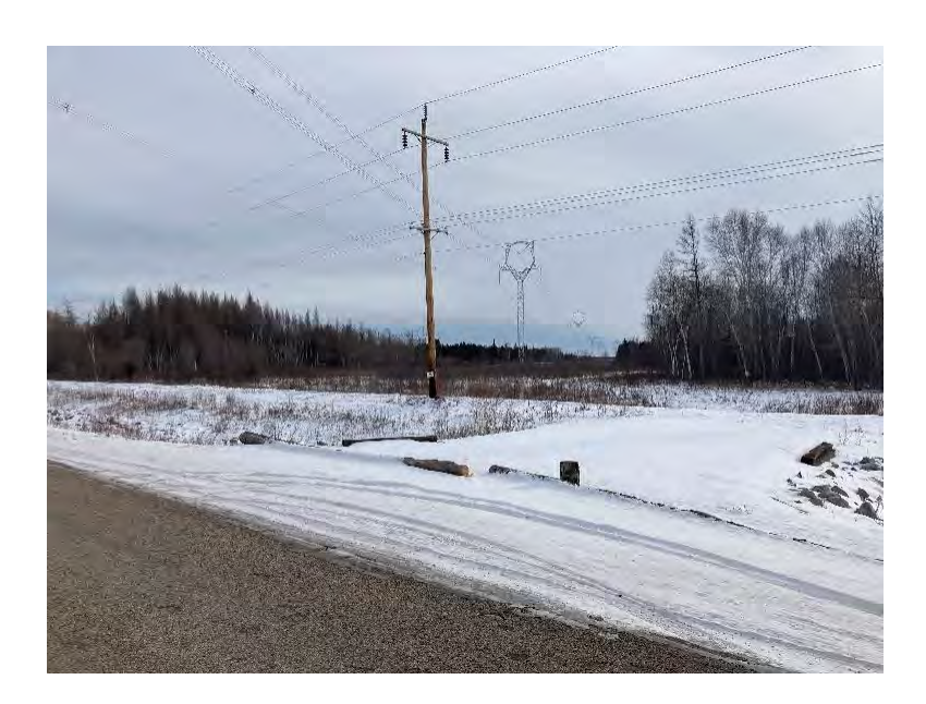
Access Management Point 441