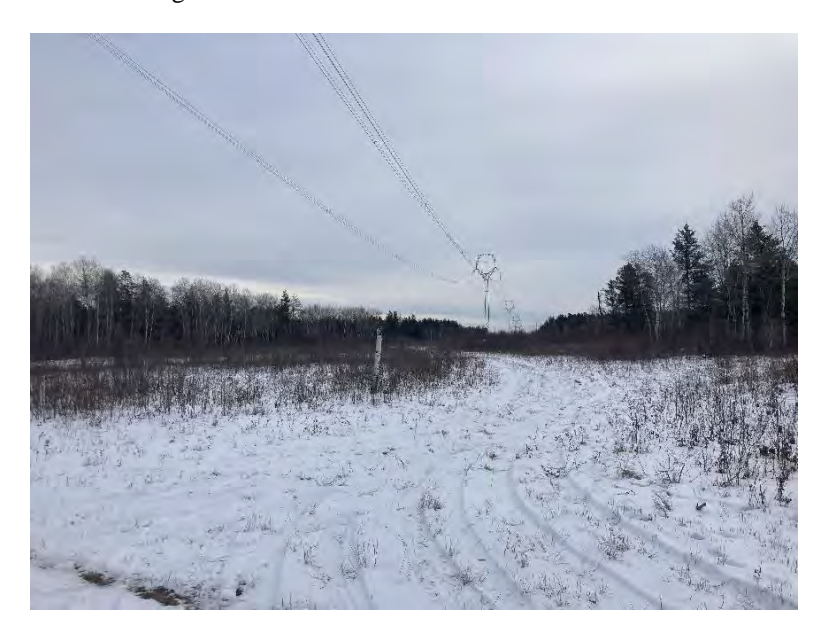
Access Management Point 406