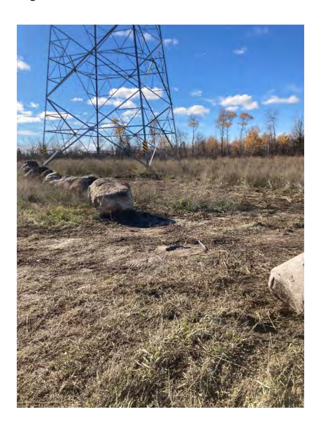
Access Management Point 255