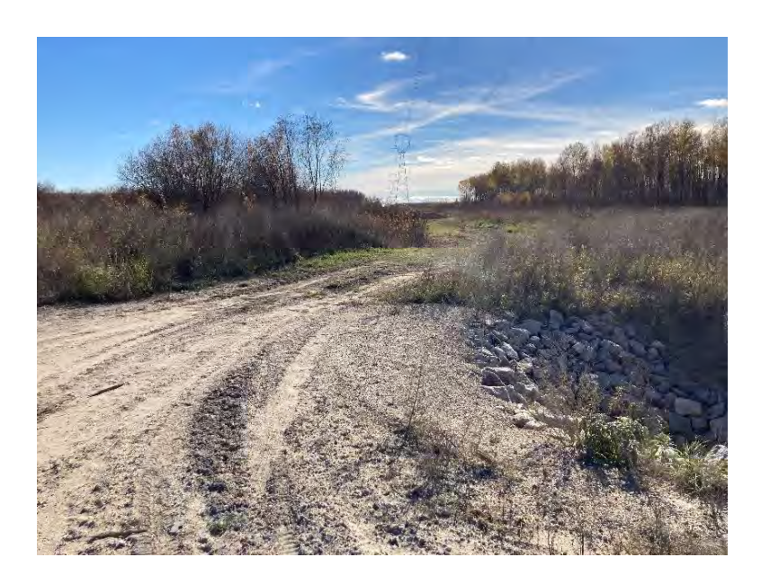
Access Management Point 335