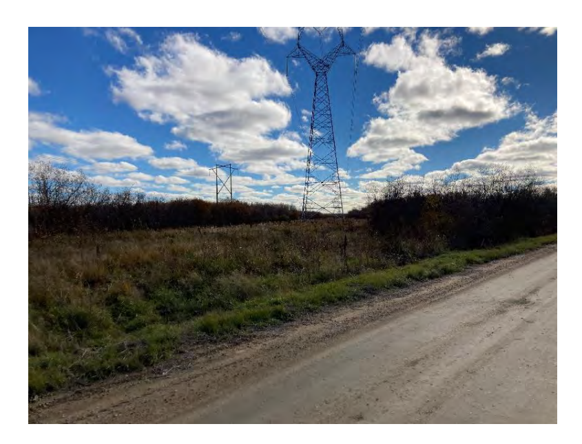
Access Management Point 283