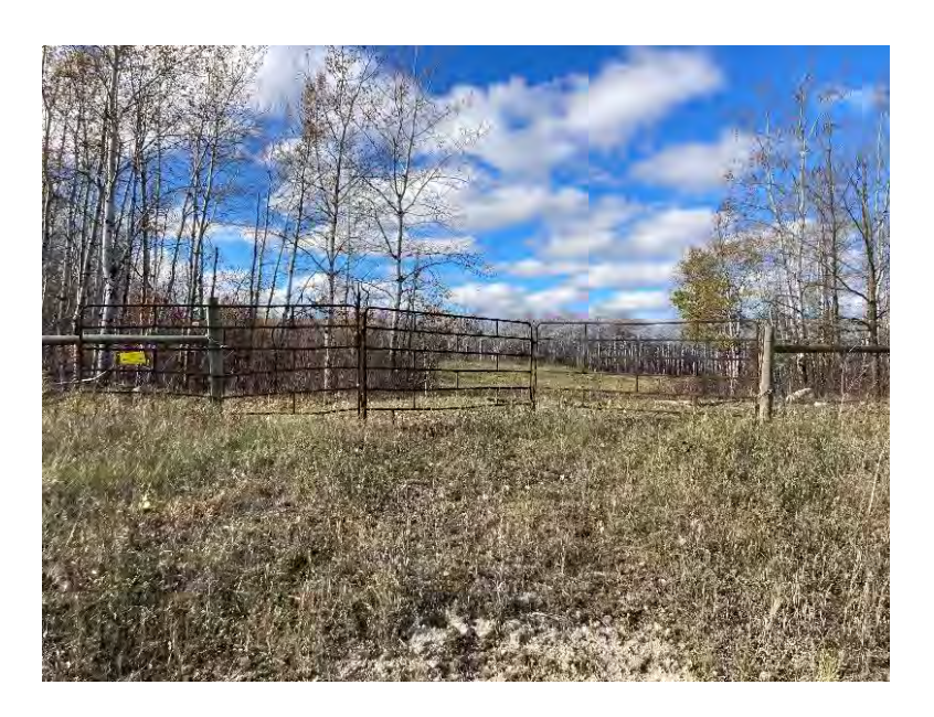
Access Management Point 300