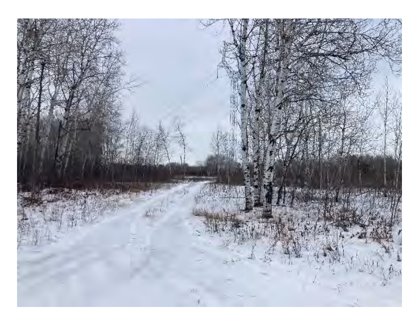
Access Management Point 405