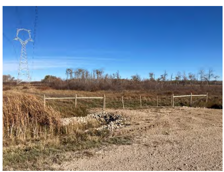
Access Management Point 229