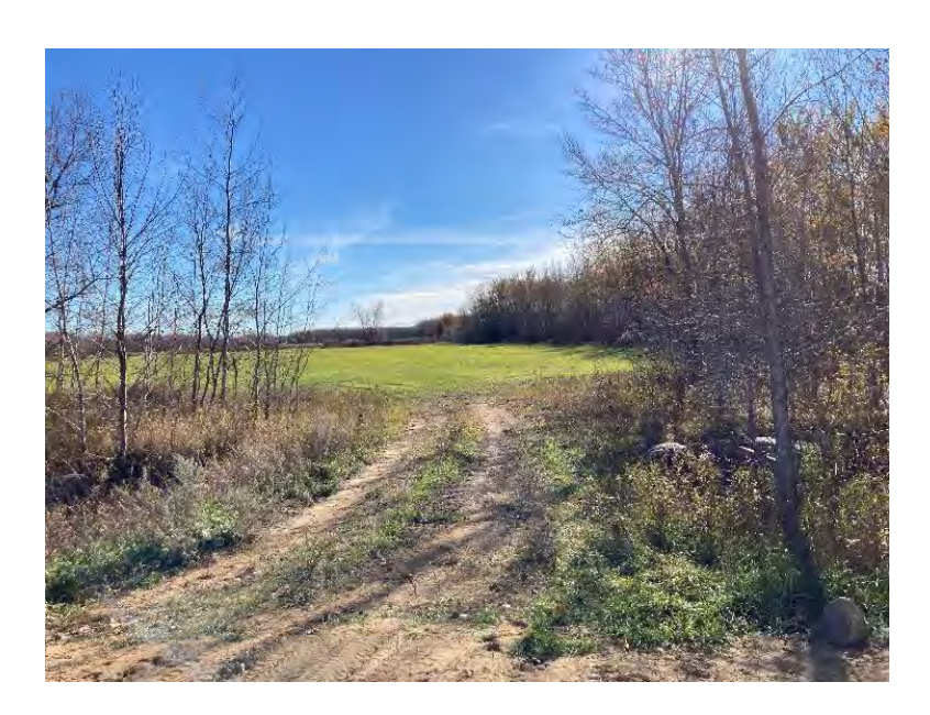
Access Management Point 346