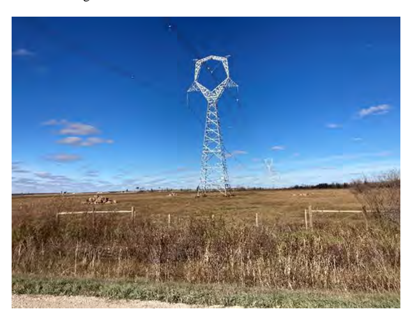
Access Management Point 317