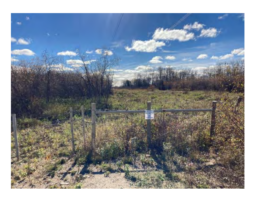
Access Management Point 318