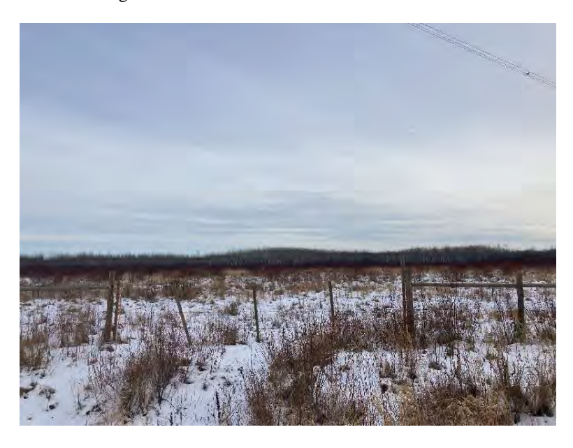
Access Management Point 381