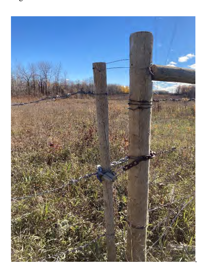
Access Management Point 256