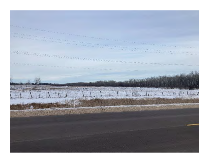
Access Management Point 385