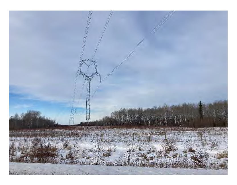
Access Management Point 440