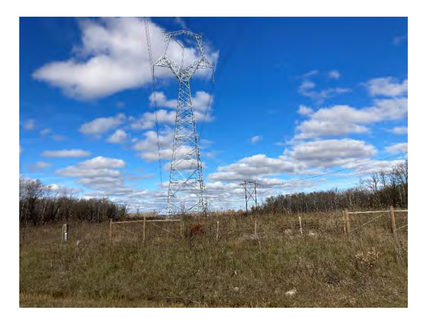
Access Management Point 284