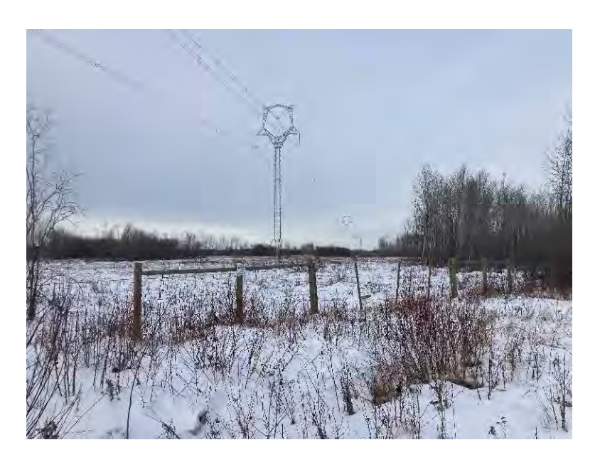
Access Management Point 380