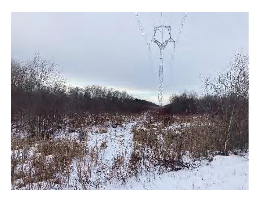
Access Management Point 401