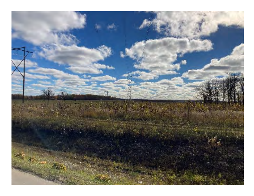
Access Management Point 285