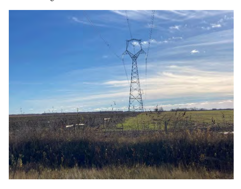
Access Management Point 352