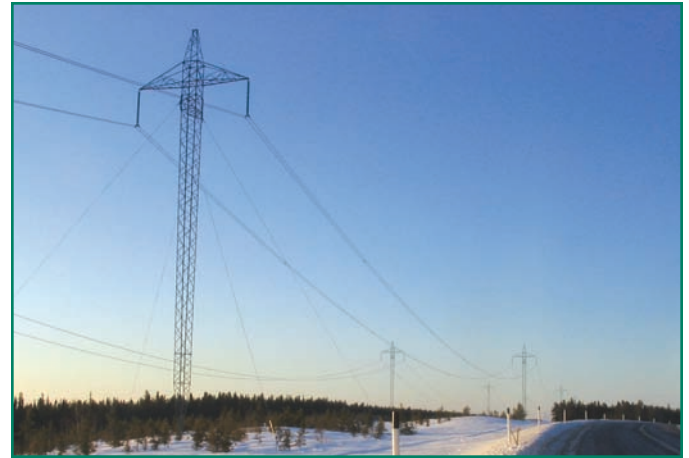
Bipoles I and II Transmission Lines