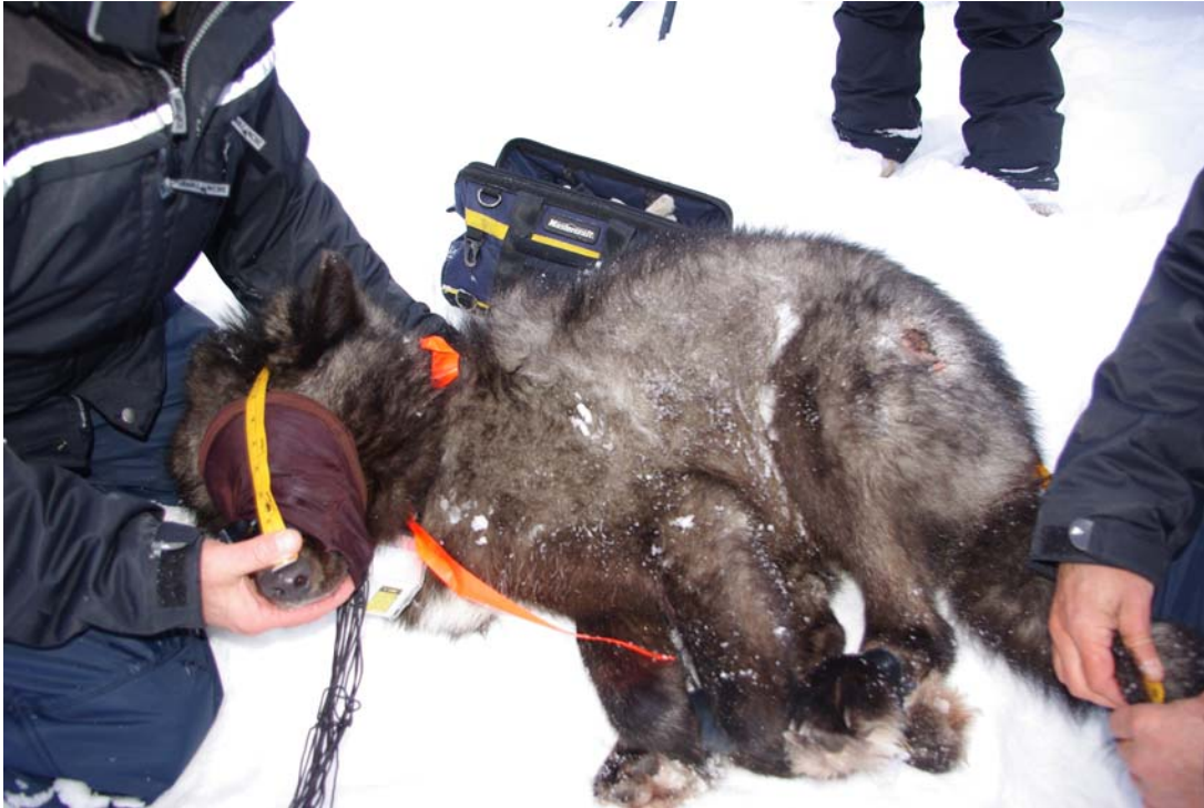
Figure 2: Captured Wolf Being Restrained For Collaring and Examination by Crew Members

During the course of grey wolf telemetry studies conducted for the Project, distribution and location of grey wolf packs combined with mortality and collar performance resulted in variable collar distribution across the Project Study Area.