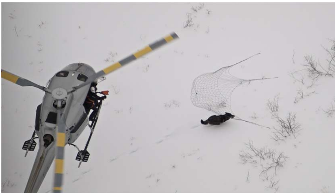
Figure 1: Wolf Captured Using Aerial Net Gunning from a Helicopter by Heli Horizons Inc. Winter 2010

Capture and collaring of wolves were undertaken by Manitoba Conservation through the services of a custom capture company. Wolves were captured using aerial net gunning from a helicopter (Figure 1), rather than chemical immobilization. Once captured, basic measurements (total animal length, neck girth, sex, and coloration) and biological samples (hair and fecal) were taken (Figure 2). Argos tracking collars were then placed on the animals and then were released. Argos tracking collars use a VHF beacon to allow for relocation using standard radio telemetry methods. GPS locations are acquired every four to six hours and data are transmitted every nine days via the Argos satellite system and made available for the client through a web-based server (Telnet) or email from CLS America Inc. Wolf movements were monitored and home range and movement data were processed using ArcMap software (ESRI©, 2011).