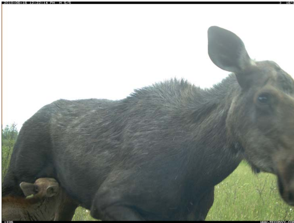
Figure 5: Trail Camera Picture of Cow and Calf Moose, Summer 2010