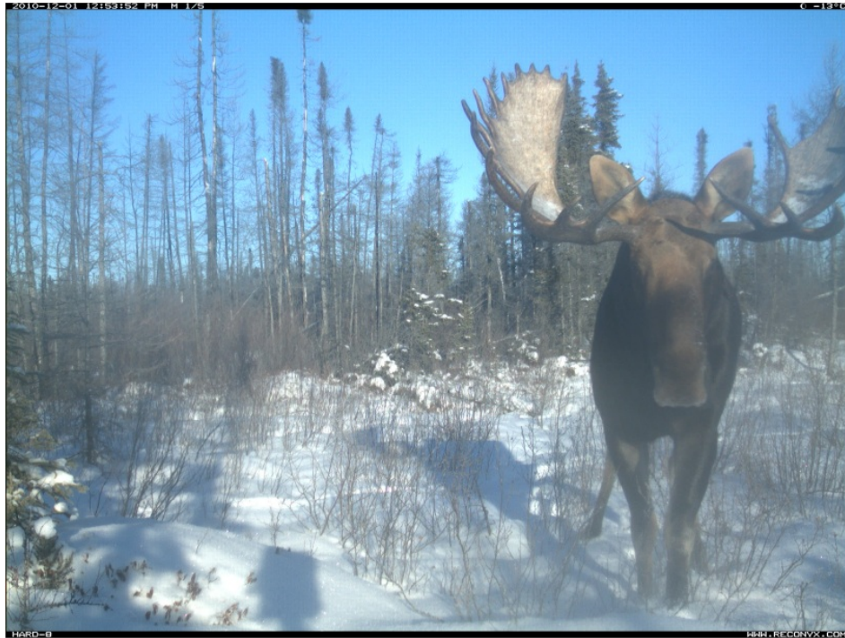
Figure 4: Trail Camera Picture of Bull Moose from the Harding Lake Area, December 2010