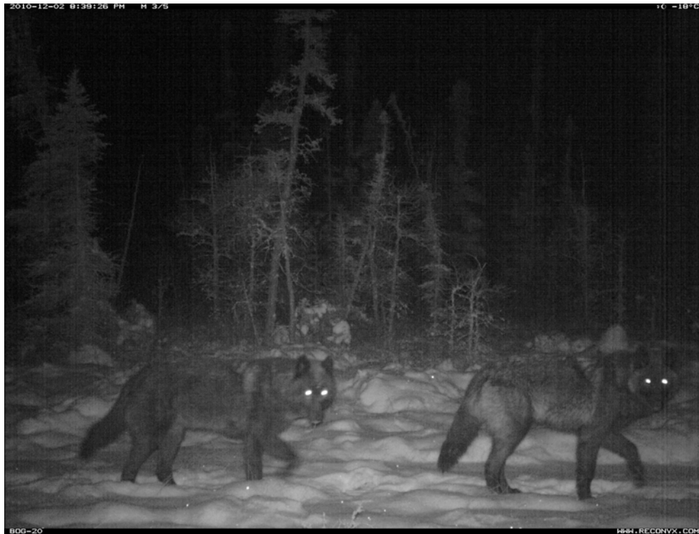
Figure 6: Trail Camera Picture of Wolves from the Bog Area, December 2010