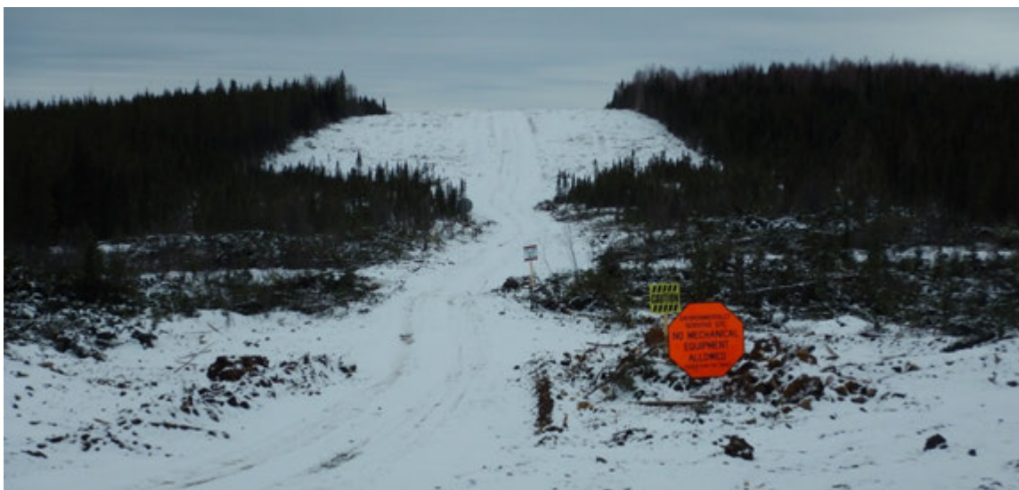
Photo 9-12 Winter Clearing of a Transmission Line ROW

ROW clearing for the Final Preferred Route will involve clearing an 80 to 100 m wide ROW through 36 km of forested habitat on the New ROW (near Ste-Geneviève, Richer and Sundown). Less clearing will be required along the remainder of the 179 km ROW, including the Existing Corridors, due to the lack of treed habitat. Notable exceptions are the riparian areas associated with Assiniboine River and Red River crossings, which will require some limited clearing of tree vegetation only. In forested areas of the New ROW, forested habitat will be converted to open habitat that will eventually be recolonized by grasses, forbs, and shrubs (Photo 9-13).