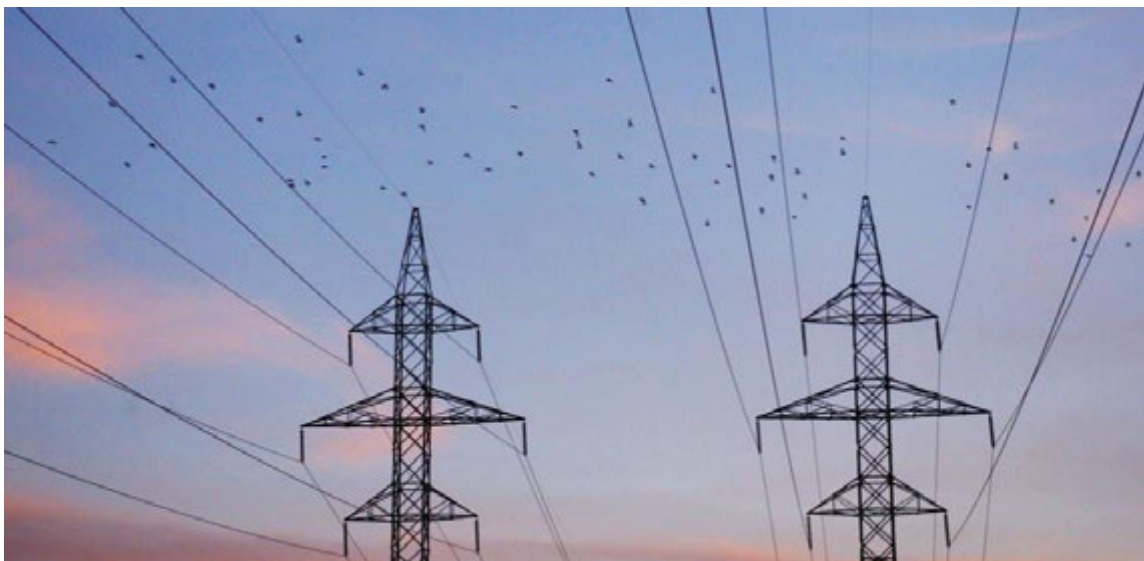
Photo 9-6 Bird Movement Surveys

The potential for birds to collide with overhead wires is elevated in areas where large numbers of individuals congregate and undertake daily movements. The degree of risk can be better understood and mitigated through knowledge of typical movement patterns, including numbers, timing, and direction of flights. A bird movement survey (Photo 9-6) targeted key waterbird staging areas to address this gap in knowledge.