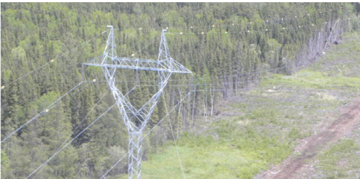
Photo 9-16 Bird Flight Diverters on and Existing Transmission Line