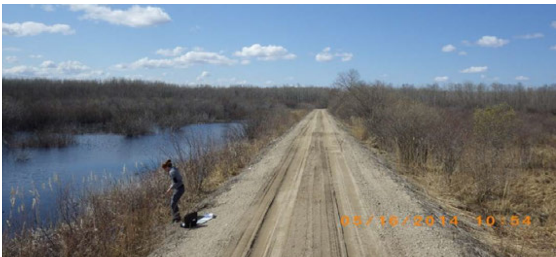
Photo 9-8 Wetland Herptile Surveys