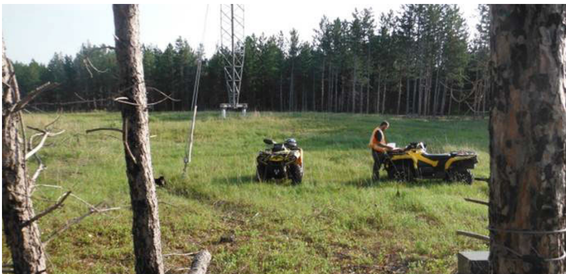
Photo 9-1 Remote Camera Deployment