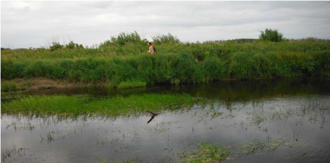
Photo 9-9 Herptile Visual Encounter Surveys