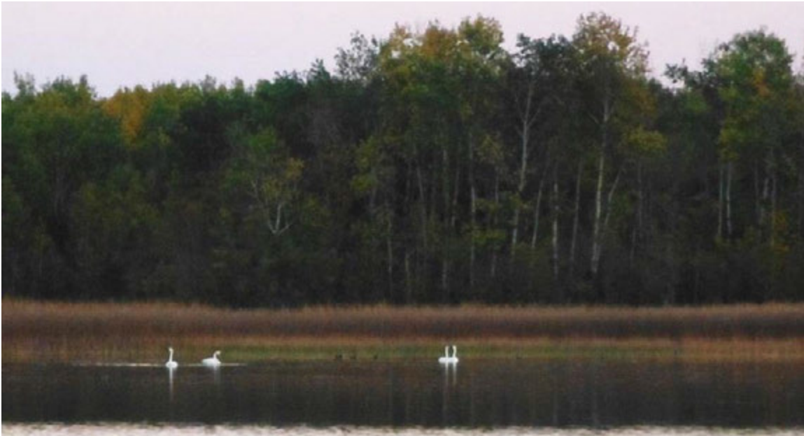
Photo 9-5 Bird Migration Surveys