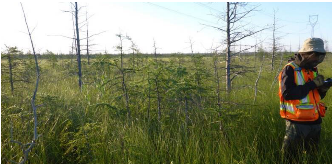
Photo 9-3 Breeding Bird Surveys

Development of the Project could result in the loss and/or alteration of some bird habitat due to land clearing. To understand how these changes will affect birds, surveys were required to characterize the bird communities inhabiting grasslands, forests and wetlands (Photo 9-3).