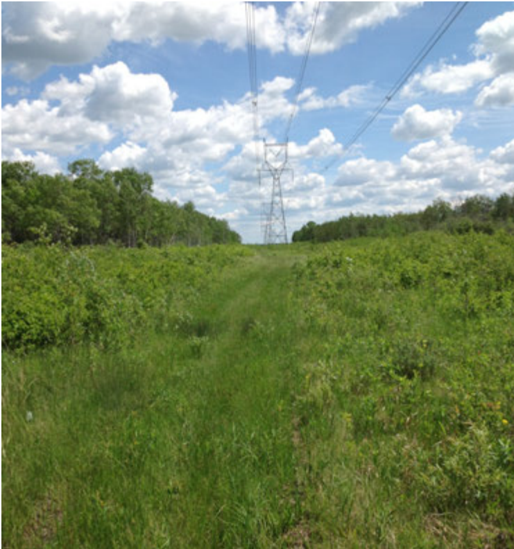
Photo 9-13 Shrub Regeneration along a Transmission Line ROW

Many forest-dependent wildlife (e.g., white-tailed deer, black bear, ovenbird; Table 9-1) will lose some habitat during ROW clearing. This is likely to be of greatest concern for forest interior songbirds (e.g., ovenbird) and forest interior mammals (i.e., American marten).