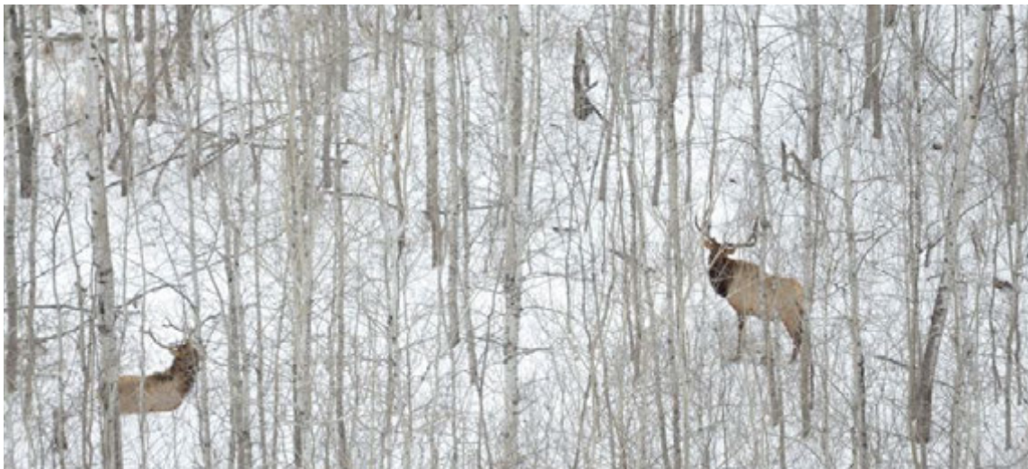
Photo 9-2 Aerial Winter Track Surveys

An aerial survey of mammals and mammal tracks during late winter period (Photo 9-2) is an efficient way of determining large mammal distribution, species composition and movement patterns over a large area.