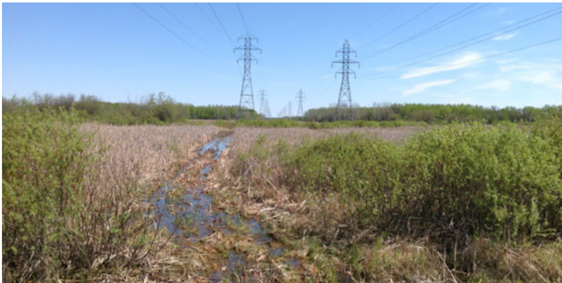
Photo 9-14 Wetland Habitat Traversed by a Transmission Line ROW

and along the eastern portion of the New ROW (e.g., near Ste-Geneviève, Richer, La Broquerie, southwest of Marchand, southwest of Watson P. Davidson WMA, and near Piney; Map 9-25 – Grassland Habitat in the RAA).