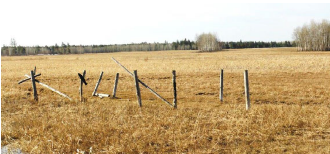
Photo 9-4 Sharp-tailed Grouse Lek Surveys