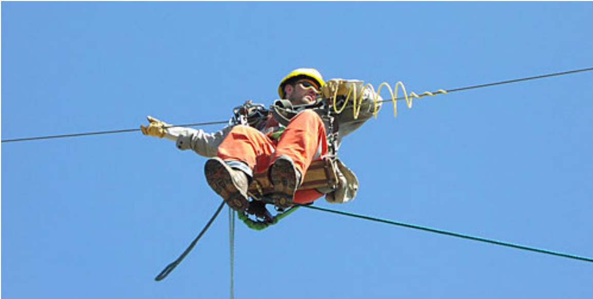
Photo 9-15 Installation of Bird Flight Diverter