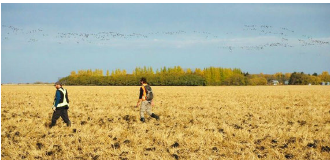
Photo 9-7 Bird Mortality Surveys

Development of the Project could elevate the mortality risk to migratory birds moving through the region due to the presence of overhead wires. Although a number of studies have been undertaken around the world to assess collision rates with transmission lines, many variables influence the results including land cover, topography, and proximity to major migratory flyways. Since no existing data are available for southern Manitoba, monitoring of existing transmission lines in the RPA (Photo 9-7) was undertaken to provide an estimate of collision risk for the Project.