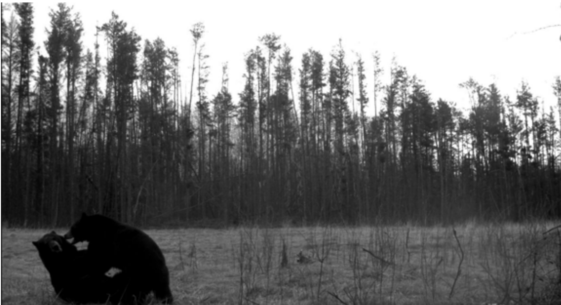
Photo 9-11 Camera Trap Photo of Two Black Bears on Existing Transmission Line ROW M602F