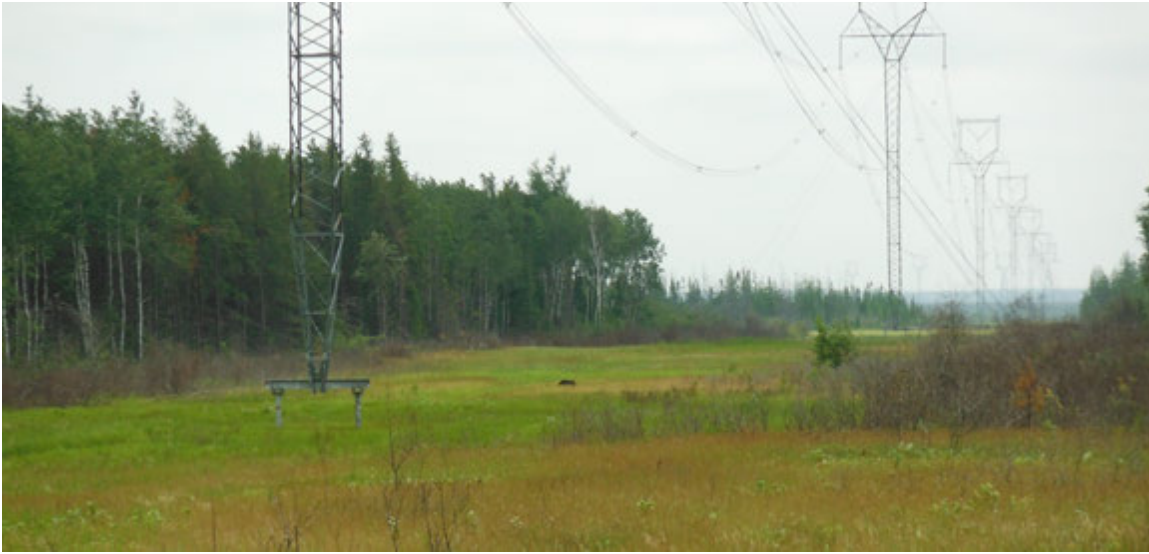
Photo 9-10 Black Bear on Existing Transmission Line ROW M602F