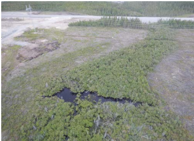
Photo 4: No evidence of vehicle track damage in 2017 with shrub re-growth present throughout this water course crossing.