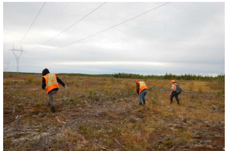
Photo 10: Survey personnel searching for bird-wire collisions at environmentally sensitive sites.

Survey information will contribute to evaluating long-term changes or trends in bird wire collision rates on this and other Manitoba Hydro transmission Projects.