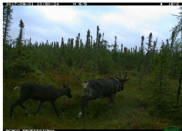
Photo 5: Collared caribou and calf in a peatland complex near the Project in 2017.

A detailed report on the findings of the caribou population and sensory disturbance survey can be found in the 2017 KHLP Keeyask Generation Project Terrestrial Effects Monitoring Report.