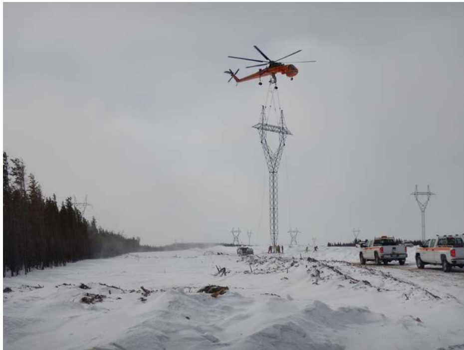
Photo 1: Keeyask Transmission Project is located south of Gillam, MB. Construction of GOT lines 2 and 3 is nearly complete.