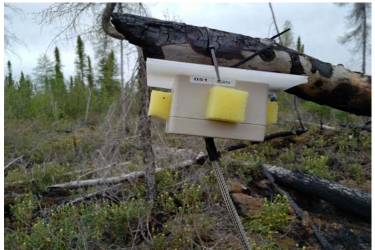
Photo 12: A passive audio recorder to monitor bird species of conservation concern.

and distance of each bird to the fixed location of the recorder will be estimated and the positions of the bird in its territory will be mapped. Audio recordings are being analyzed and results are pending. Survey support was provided by members of the Keeyask Cree Nations, including Tataskweyak, War Lake, York Factory and Fox Lake Cree Nations.