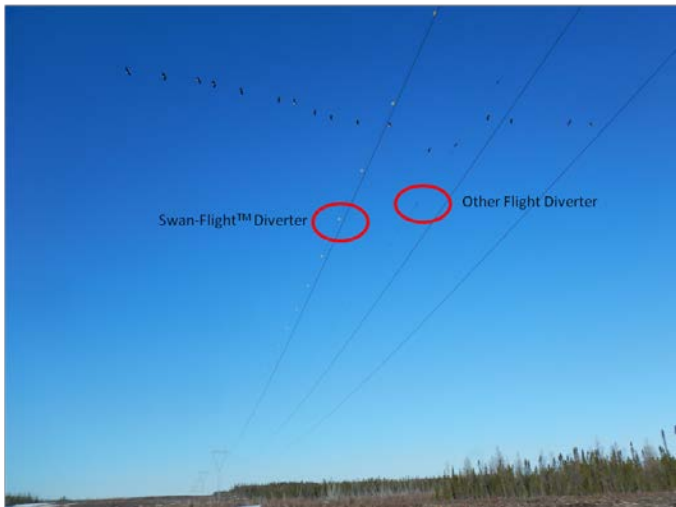
Photo 11: Canada geese flying over bird diverters installed on the generation outlet transmission line.